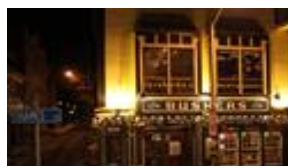
Trivia at Buskers Irish Pub!

Date: March 12, 2014 Time: 7:00pm Where: Buskers Irish Pub Address: 178 Thames St. Newport, RI 02840 Cost: Meal included in registration fee – cash bar Dress Attire: Festive & Casual!